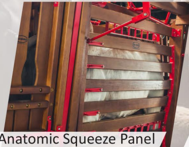
Anatomic Squeeze Panel