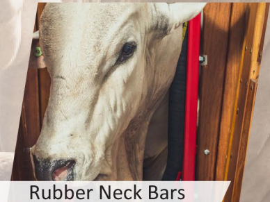
Rubber Neck Bars