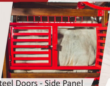
Steel Doors - Side Panel